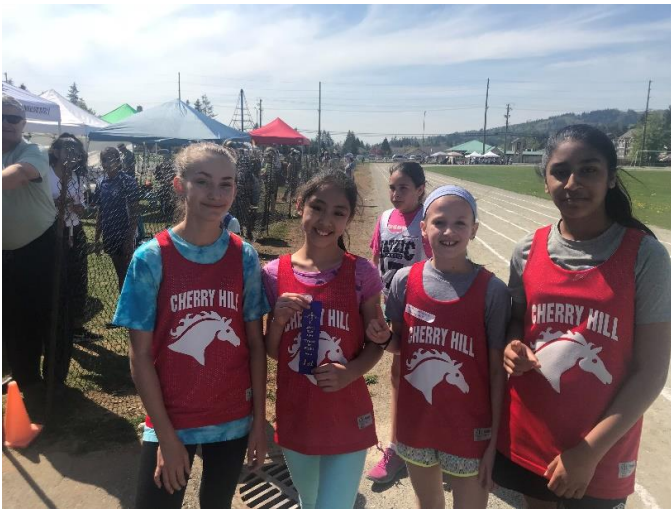
Our Gr. 6 girls' relay showing off their 1 st place finish at our District Track and Field Meet.