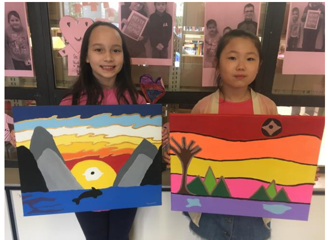
Students showing off their completed 'The Elders Are Watching' paintings. The project is well underway and very exciting.