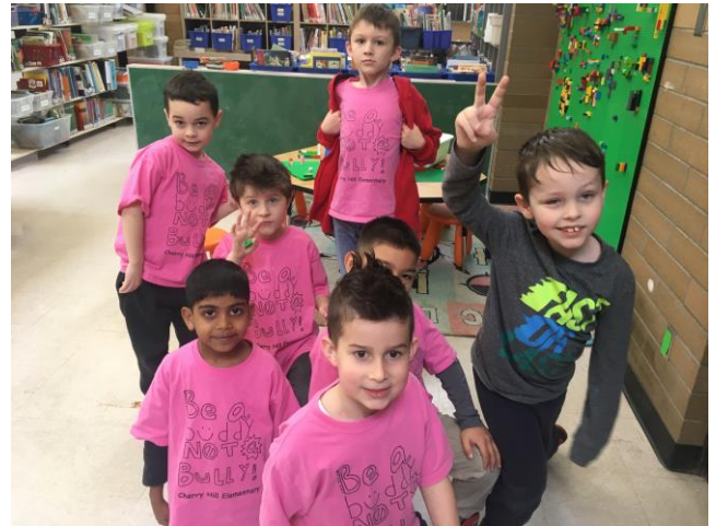
Students from Division 10 showing the love on Pink Shirt Day!