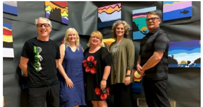
Proud School Trustees in attendance at our Art Show. Keep an eye on the Mission Record for an upcoming article.

Our Cherry Hill Sports Day is scheduled for June 7 th . This is an all day event, rain or shine! Please have students dress appropriately for a day of activity! Please note, as in years past, we will have an early dismissal of 1:50pm. If you are not able to pick your child up early that day, please let their teacher know, and supervision will be organized until the regular 2:22 dismissal. Students that normally go to Club Kids after school will be supervised in the gym until Club Kids begins. Planner inserts with reminders about our Sports Day will come early this week. Our PAC will be at the event with concessions items. Community members are encouraged to attend!